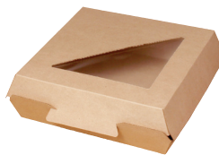
Personal pan pizza NFN-F663RQVTWF