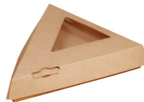
16" pizza - 6 cut NFN-F808RQVTWF