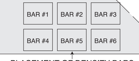
PLACEMENT OF DENSITY BARS (UP TO 6 COLORS)

CLONE THIS AREA INTO AREA INDICATED AT PART LEFT OF MOUNTING